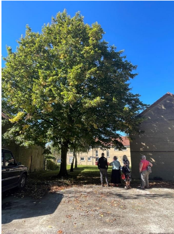
Image showing an overgrown tree where the height of the tree is above the roof of the flats.