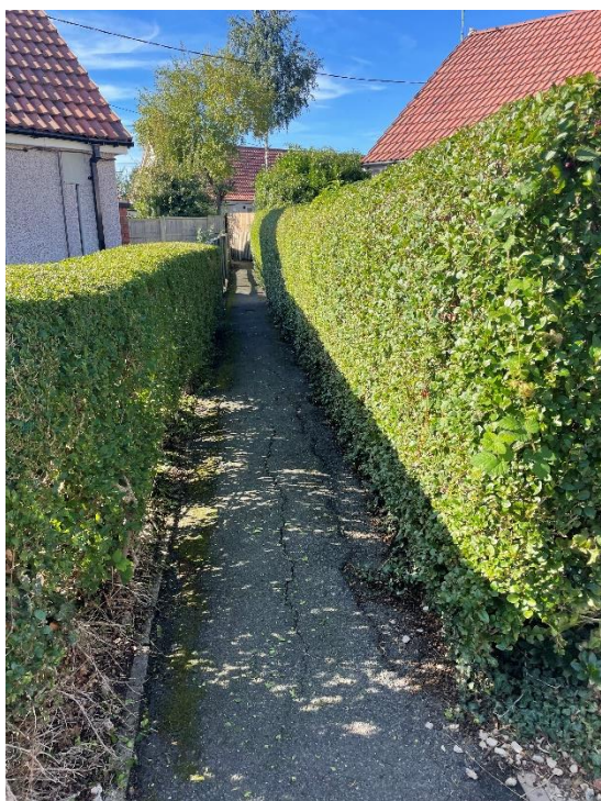
Image showing two hedges owned by Bolsover District Council which tenants have chosen to maintain themselves.

The hedge is maintained on the side adjacent to the pavement in summer months as per service standards.