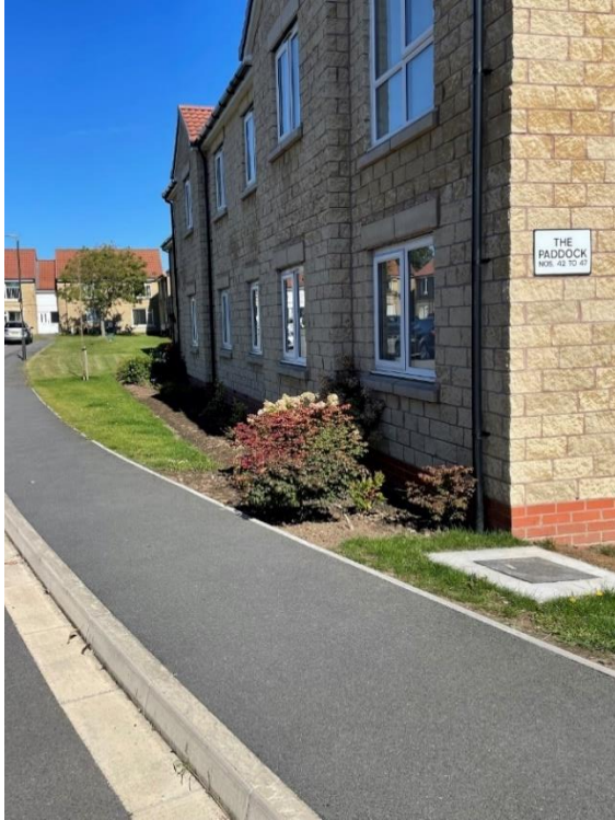
Image showing an overgrown shrub on edge of the car park.