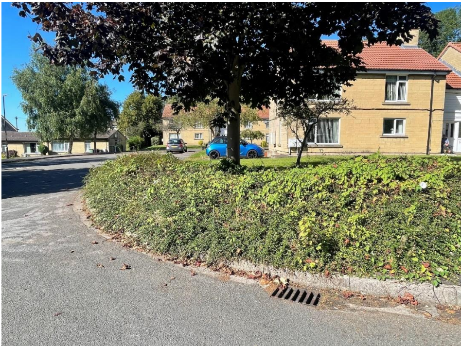
Image showing a hedge with weeds growing through.