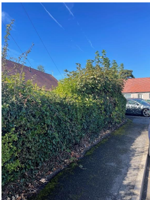
Image showing an untidy hedge with self-set trees growing at different heights.

The hedge is maintained on the side adjacent to the pavement in summer months as per service standards.