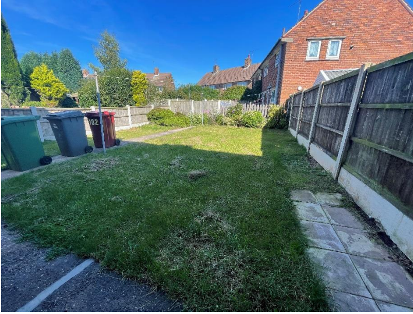
Image showing the back garden has cut grass and is well maintained.